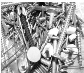
Shiny, shiny nails with a few loose screws